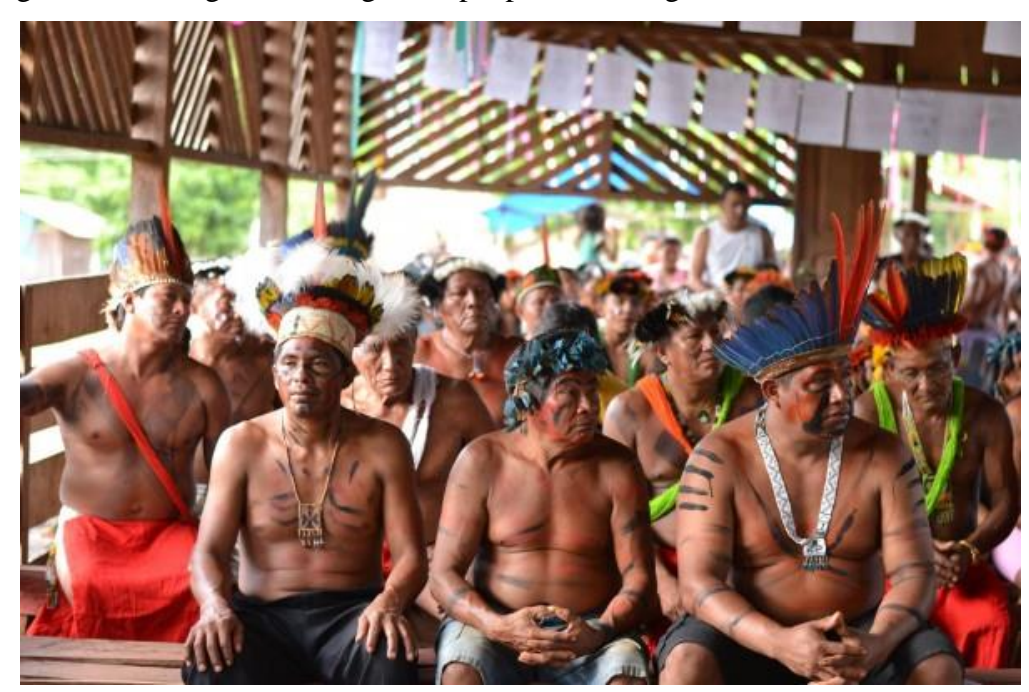
Figure 4: Meeting of the indigenous people on the regularization of their territories

Upon returning to the Trombetas, Cachorro and their tributaries, the Katxuyana indigenous people organized themselves politically to claim their rights for the demarcation of their traditionally occupied lands, creating the Kaxuyana, Tunayana and Kahyana Indigenous Association (AIKATUK), with support from the Indigenous Research and Education Institute (IEPÉ) and the São Paulo Pro-Indian Commission (figure 4).