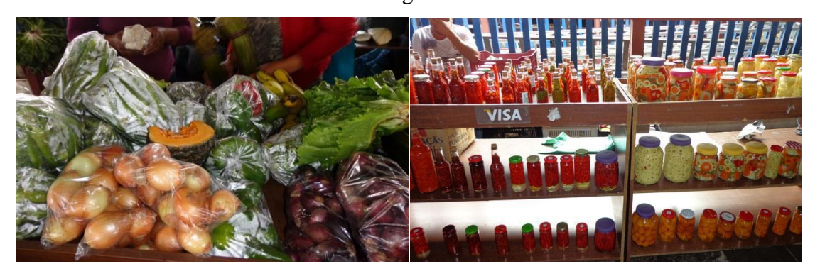
Figure 4: Fruit and vegetable stall on the left, and pepper and canned food stall on the right

The stalls selling rural products are characterized by the presence of rural workers, housing a wide variety of sellers and products, such as cereals, vegetables, fruits and vegetables, meats, free-range chicken, dairy products (cheese and curd), sweets (milk, lime, orange, papaya, and brown sugar), condiments, and seasonings.