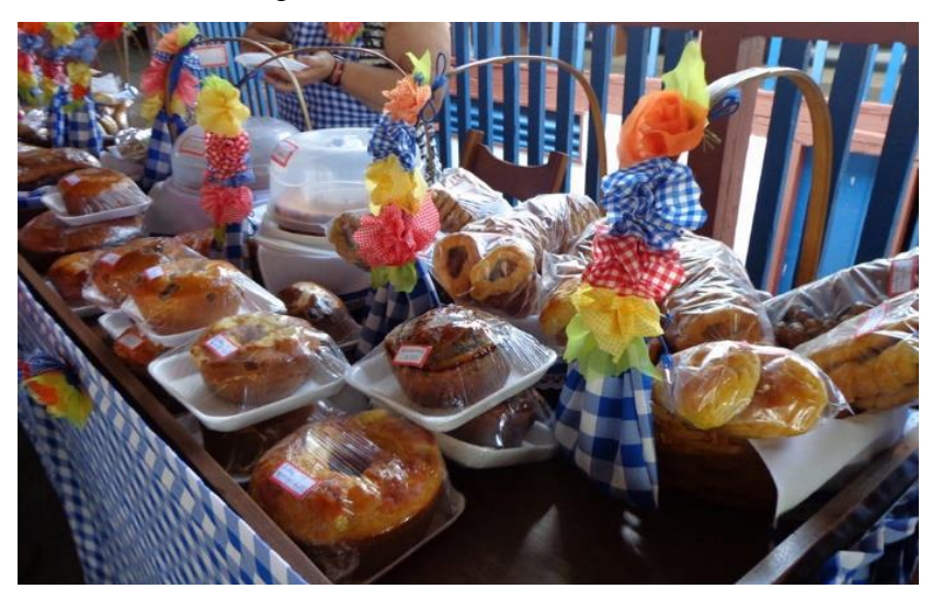
Figure 1: A stall with delicacies